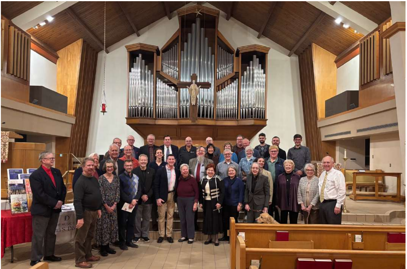
Pittsburgh Chapter Members at Mt. Lebanon Lutheran Church